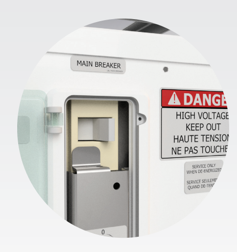
Safety Interlock System is designed to prevent the input voltage selection from being adjusted while powered

Lex Products WeldingRack™ WR6 is a welder storage and power distribution rack system in one. The WR6 supplies onboard power to (6) welder packs while providing 120VAC GFCI protected receptacles for tool power.