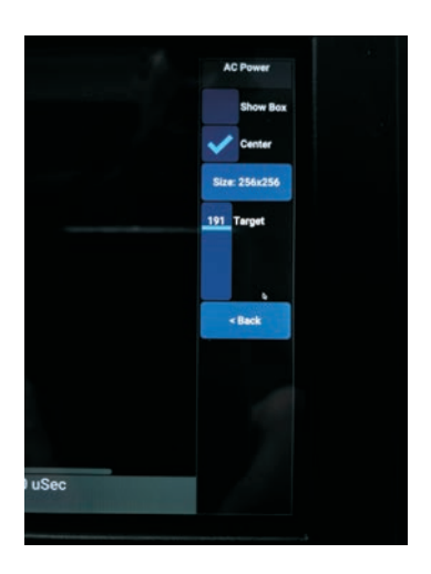
AUTOMATIC EXPOSURE CONTROL MENU