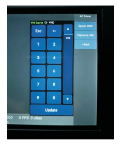
EXPOSURE TIMES SETTINGS MENU