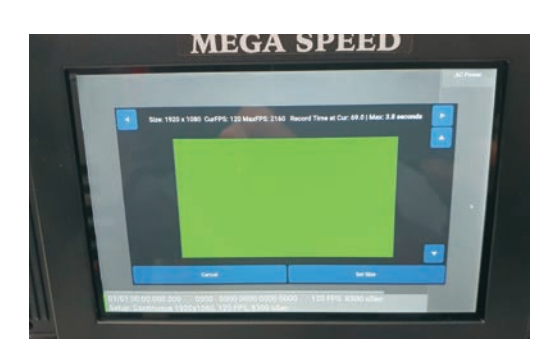
CUSTOMS IMAGE SIZE SETTINGS MENU