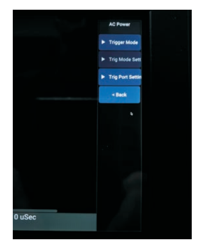
TRIGGER MODE SETTINGS MENU