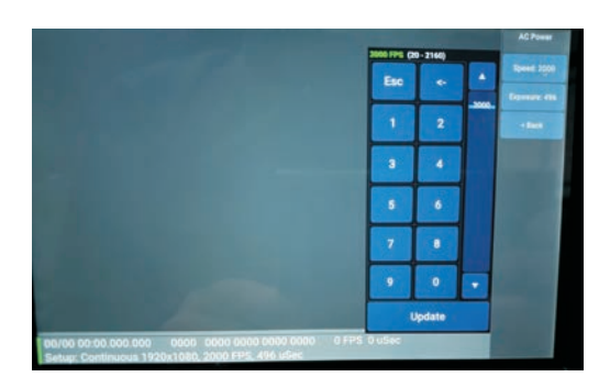
RECORDING SPEED SETTINGS MENU