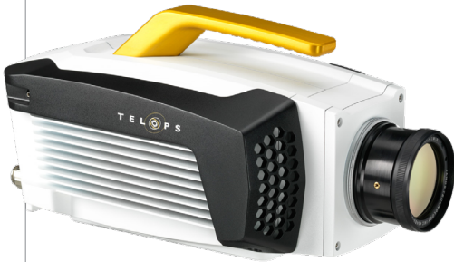
The IP-67 certified enclosure