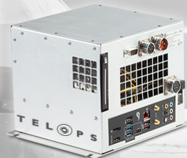
Control and Processing Box