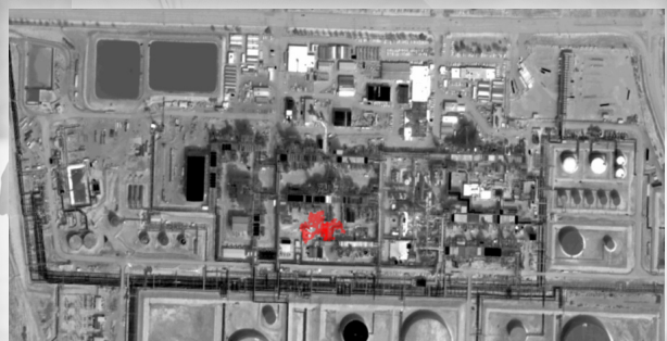
Gas emission from oil plant.

Please note that these specifications are subject to change.