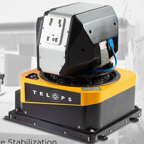
Active Stabilization Platform