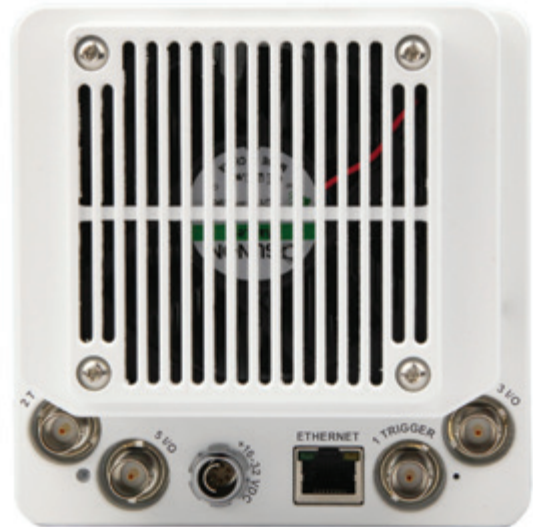
VEO S-model (Top), L-model (Bottom)