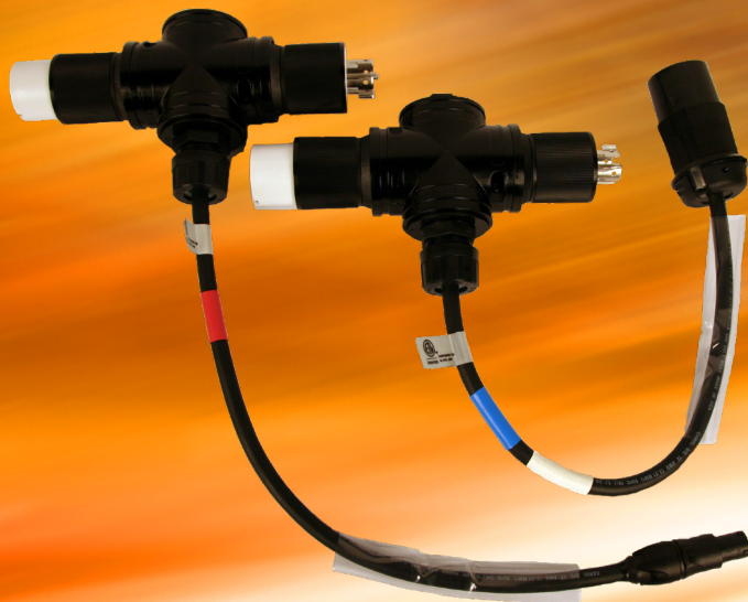
A5040-TRUE1C-B (left) & A5040-L620C-CA (right) shown