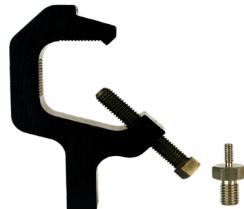
04-160-A11 Clamp with Adapter